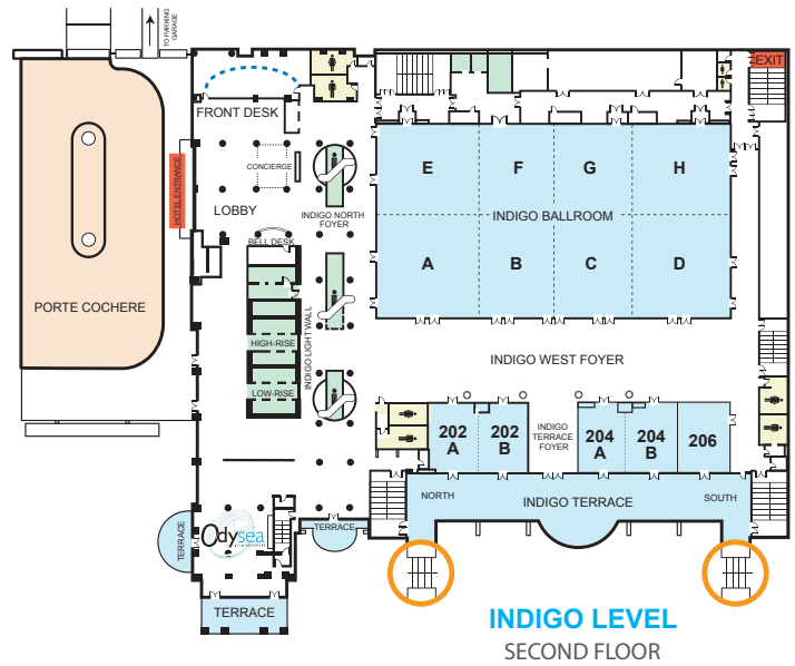
INDIGO LEVEL SECOND FLOOR