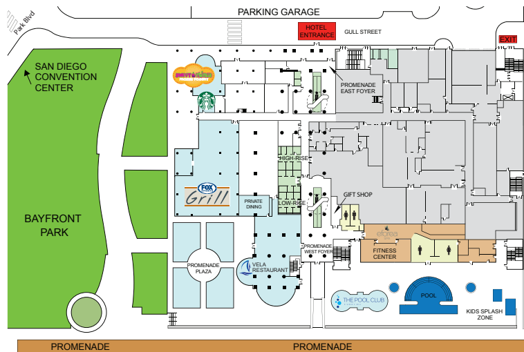
PROMENADE LEVEL FIRST FLOOR

The following Meeting Rooms are not able to be used on their own: Indigo F, G; Aqua Salon B; Sapphire F, G, J, K, N, O